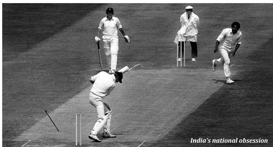
India's national obsession