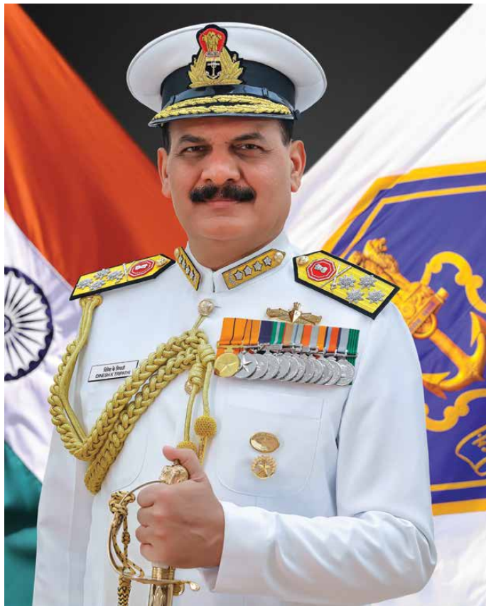
The Chief of the Naval Staff.

VAYU: With all the talk about another aircraft carrier, the IAC-2, is there any substance to this?