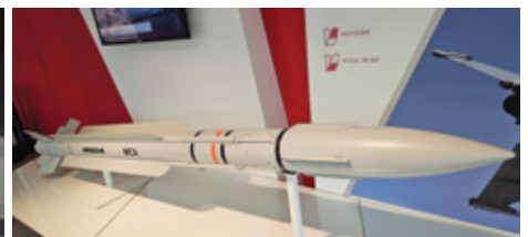
The Meteor for IAF Rafales and (right) MICA for both IAF Rafales and Mirage 2000’s.