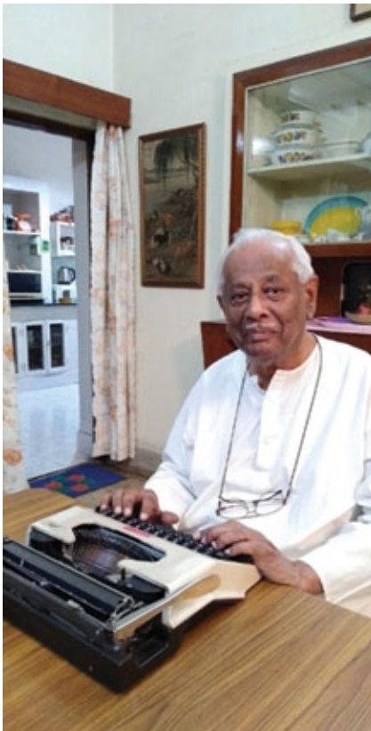
(The author of this piece and series in the Vayu magazine is busy typing away to meet the next deadline!)

boxes. He had received a message from the BM (Brigade Major) saying that thanks to the effective air support provided, they were on the move and requested that 'dono pilot ko barfi khilana! I conveyed our thanks and requested him to kindly hand over the wingman's box directly to him in the Mess. Most evenings/nights I made a visit to our loop dispersal where our night shift of technicians carried out repair and service of aircraft inside the covered blast pens. Our 'Chiefy' would brief me on the number of aircraft we could plan on for the next day; I handed over my box of barfi to him for the airmen and explained that it was a token of appreciation from the Army! I do not know what happened to the other box, but it is unlikely to have survived very long either in the Mess or the crew room!