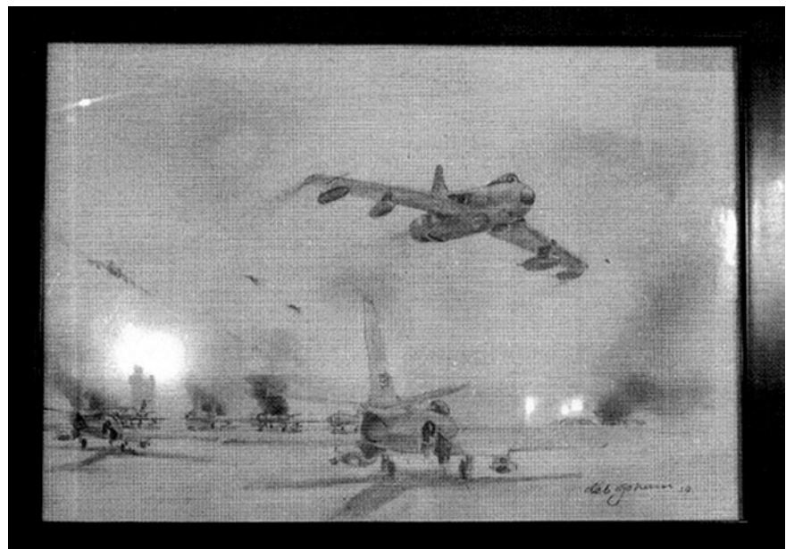
IAF Hunters raid PAF airbase Murid: December 1971

History is a link from the past to the present; it serves a purpose and exists in many forms. Creative art that accurately depicts significant air force events, is visual history. Such history should be preserved and displayed wherever it is appropriate and facilities to do so exist. Perhaps our air force may now like to think in terms of a professional art gallery in our Air Force Museum. 🦋