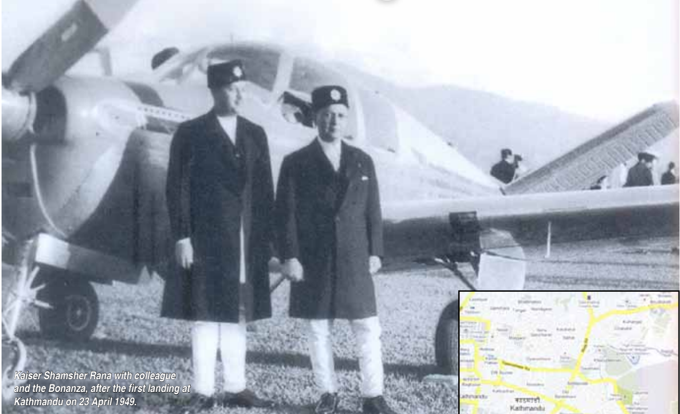
Kaiser Shamsher Rana with colleague and the Bonanza, after the first landing at Kathmandu on 23 April 1949.